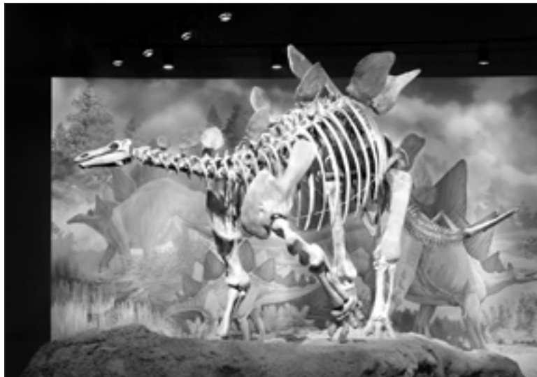
"Dinosaur #1, Vernal, UT, 2004"

ignore all the upgrade paths and stick with the tools you know. I currently use a Macintosh G4, with system 9.2.2, and Photoshop, version 6.0.1. These tools are now up to five years old, which in digital terms renders them as virtual dinosaurs. I figure my current tools and materials to be serviceable for another 2-3 years before they are completely unusable as having become virtually incompatible with any then current standard. The writing is on the wall. Manufacturers simply do not support, or encourage this kind of “dig in the heels” approach. Obviously, planned obsolescence will not be so easily deterred.