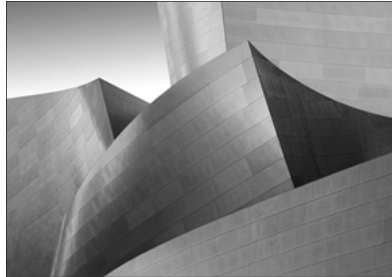
“Disney Hall #4, Los Angeles, CA, 2004”

Using digital technology to produce photographs— as a means of achieving personal and artistic self-expression— is not all that different from using the more conventional tools provided one