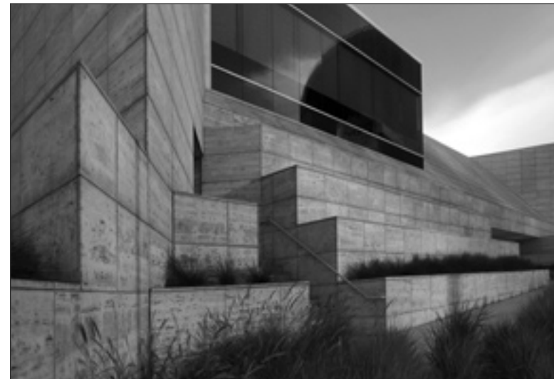
"Neiman Marcus, Las Vegas, NV, 2004"

In my view, the use of digital technology- while having the ability to exponentially expand the possibilities for new and refreshing photographic visualization and manifestation- will nevertheless continue to impede and frustrate its practitioners. Once you’ve climbed aboard the digital hamster wheel, you either commit to spending significant amounts of time re-learning the basic nuances of your tools as they incessantly change, or you do as I have and attempt (with predictably diminishing success) to