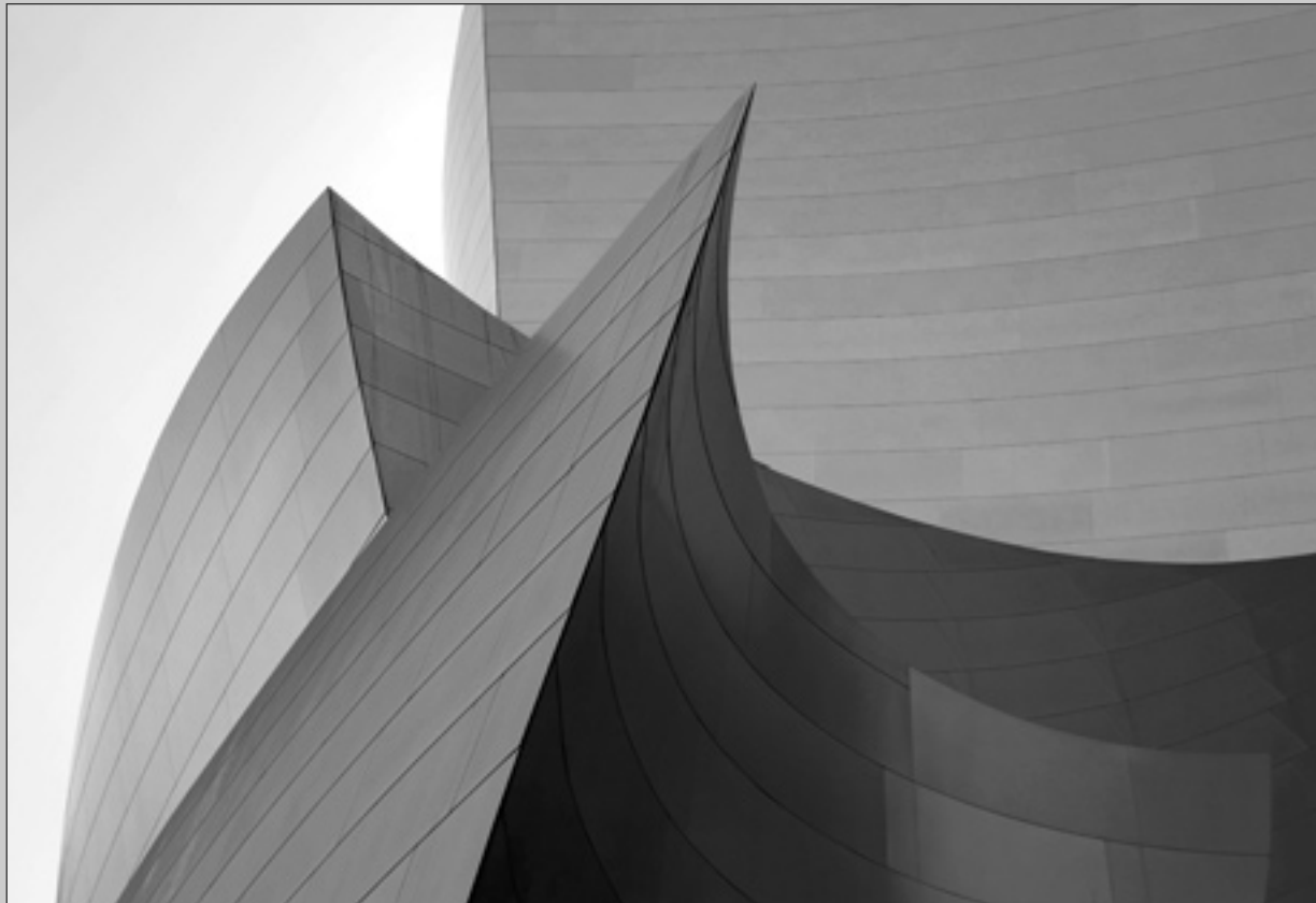
"Disney Hall #3, Los Angeles, CA, 2004"

A Cautionary Tale for the Digital Revolutionary